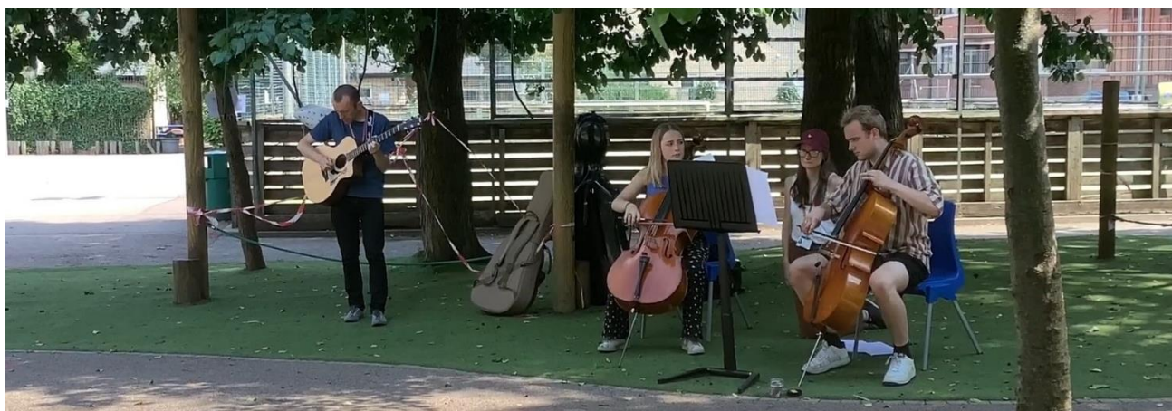
The same trio in the primary school playing covers and Neapolitan songs and Offenbach duets

I didn't realise that when I came down to Cambridge with my cello that I would be asked to get involved in a series of 'lockdown' concert performances in the street. Doing so presented all sorts of interesting challenges – how to rehearse, how to keep your music on a music stand in the wind, issues of ensemble when playing outside etc etc. However, one is used to these sorts of issues as a musician. What surprised me was the level of community engagement and the hunger of all those who attended for the sound of live music. Music seems to have awakened a deep nostalgia in everyone for the sound of music – as a musician we know about the power of music – but to see its power to unite and stimulate so demonstrably was very touching and inspiring. Everyone was SO grateful and supportive. If I could portray my experience in the form of cartoon it was like the sound of my cello was working as a spirit thread that was helping pull everyone together. I love music.