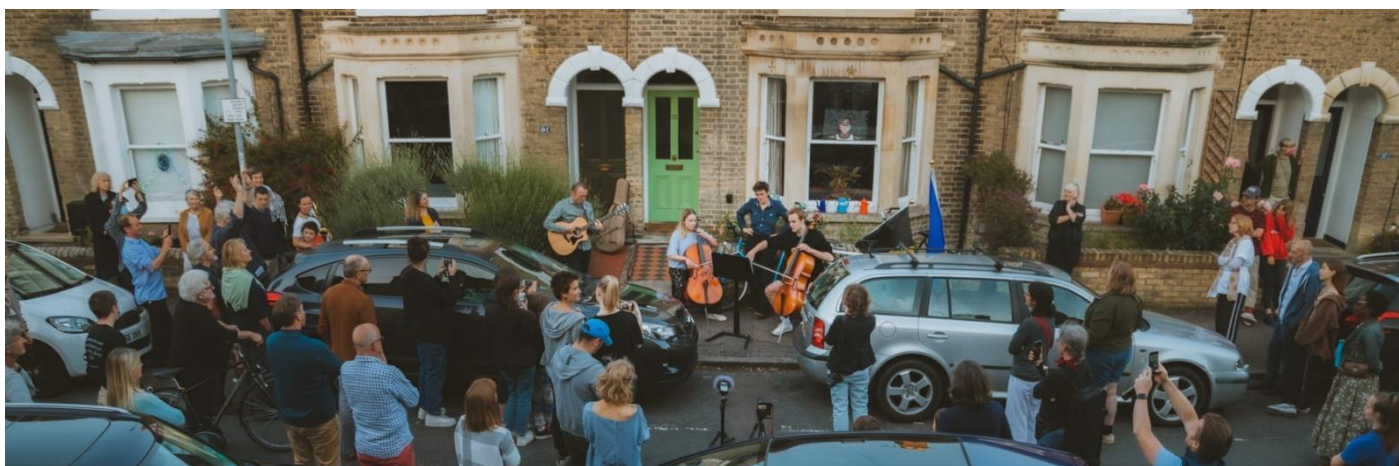
That's me in the general melee with cello playing a Nirvana cover!